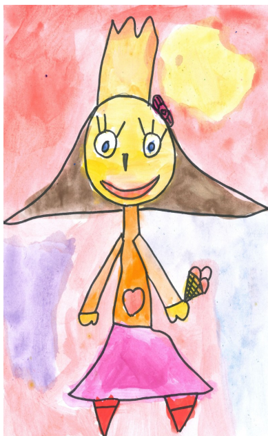
A KKFO is a place where you can play. Mia 0.a