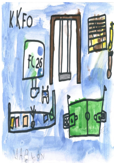
In the KKFO there are children who love to play. It is a place where children are when they have free time. Marlon 0.a