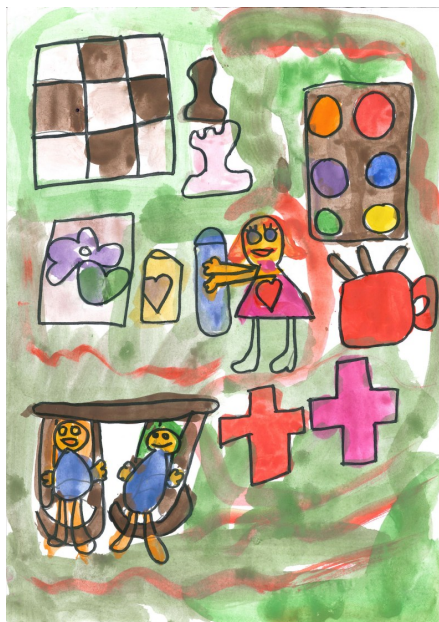
A KKFO is a place where you can do almost anything. Rosa 0.a